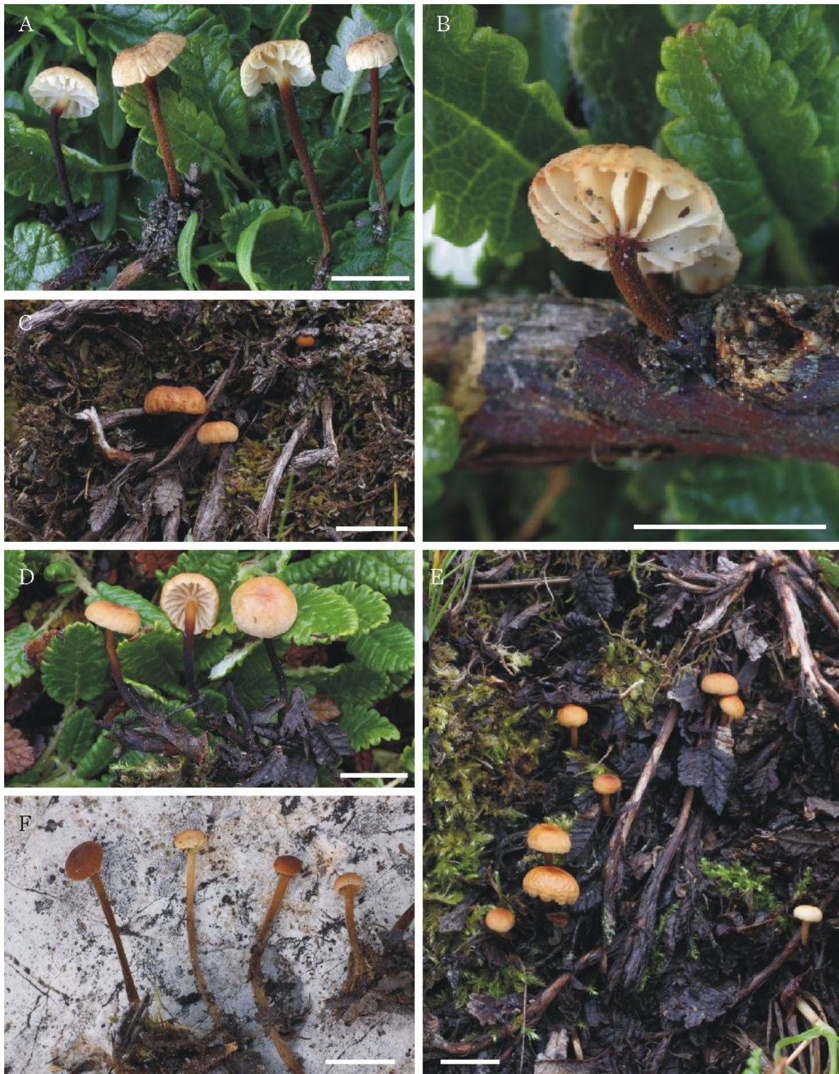
Fig. 2. Basidiomes of Marasmius epidryas occurring on dead stems of Dryas octopetala . A, B – Romania, Carpathians, Bucegi Mts. (coll. KRAM F-46706). C, D, E – Montenegro, Dinaric range, Komovi Mts. (coll. KRAM F-48020). F – Macedonia, Scando-Pindic range, Šar-Planina Mts. (KRAM F-48022). Scale bar equals 1 cm.