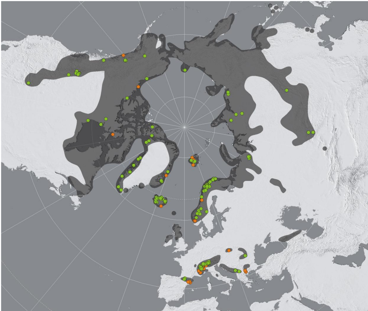
Fig. 1. World distribution of Marasmius epidryas based on all herbarium and literature records available. Green dots – herbarium data (revised collections); orange dots – literature data (not revised). Dark grey area – outline of distribution range of Dryas spp. according to Hultén and Fries (1986).

MICROMORPHOLOGY (Fig. 3): Spores 8.0–12.0(13.0) × (4.0)5.0–7.0(7.5) μm, av. 9.7 × 6.0 μm, Q = (1.2)1.3–2.0(2.25), Q av = 1.6, ellipsoid, amygdaliform, hyaline, thin-walled, non-amyloid (Fig. 3e). Basidia (32)33–58(67) × 6.5–11(11.5) μm, narrowly clavate, 4-spored, exceptionally also 2- or 3-spored, and sometimes with more than 4 sterigmata. Cheilocystidia and pleurocystidia similar, (30)39–72(91) × 5–10(17) × 2–7(9.5) μm, av. 54.3 × 7.3 × 4.6 μm, fusiform, lageniform, cylindrical, usually with a capitate